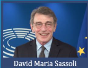
David Maria Sassoli